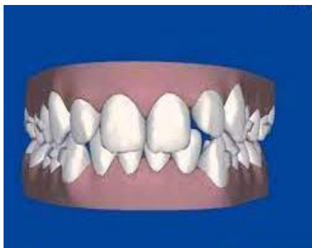
Fig 2: 3-D model generated using CT scan & CAD-CAM