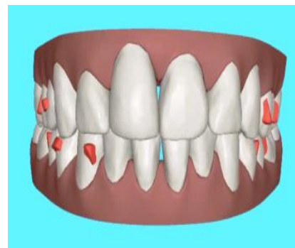
Fig 3: pressure points identified by software