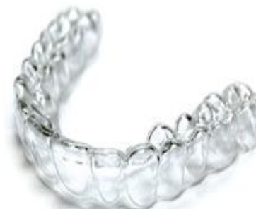
Fig 5: Clear thermoplastic appliance.