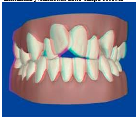
Fig 4: Clincheck – expected post treatment model.