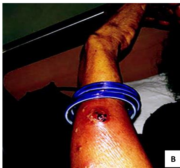
Figure 1(A,B): Erlotinib-induced pustular skin lesions affecting face, leg, and hand